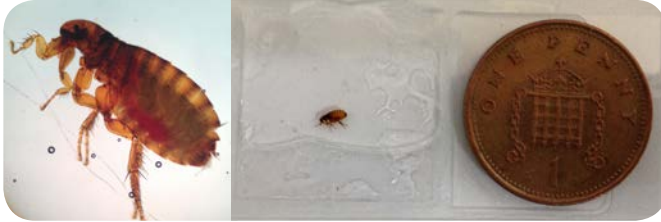
A flea seen under the microscope

Although they are small they can be seen with the naked eye and are about 1-3 mm long. They have flat bodies and very powerful back legs which mean they can jump huge distances for their size.