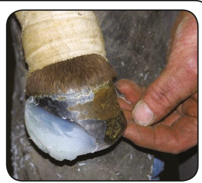
Applying a hoof extension to correct ALD