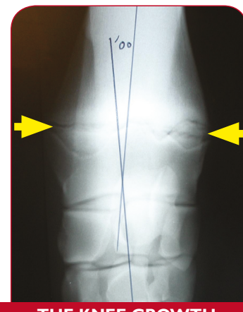
THE KNEE GROWTH PLATE, WHERE ALD'S OFTEN OCCUR