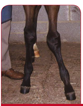
ALD OF THE KNEE WITH BENDING OF THE LOWER LEG